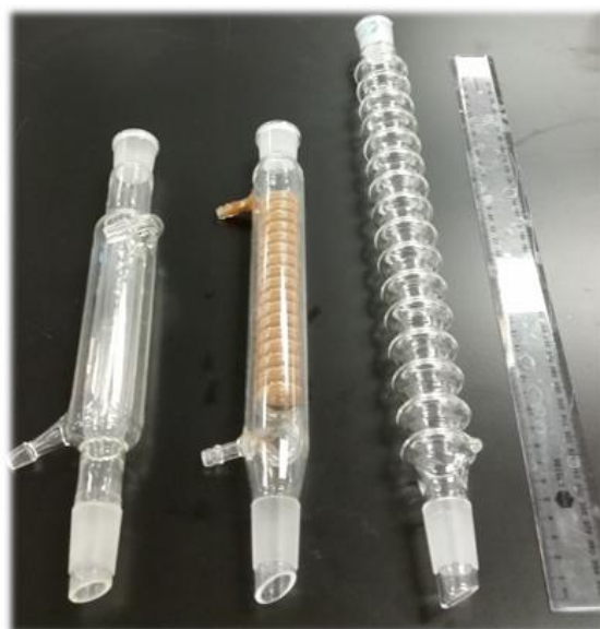
Figure 2. Photographs of condensers used in this test: a Davies double surface condenser (left), a coiled condenser (centre) and a CondensSyn (right). A 40 cm ruler (far right) is shown to give an estimate of scale.

The CondensSyn was tested against two conventional water-driven condensers – a Davies double surface condenser (which contains both an inner and outer water jacket), and a coiled condenser (Figure 2). It should be noted that both of these are more efficient (and more expensive) than a standard single surface Liebig condenser. Both are approximately 30 cm in length, while the CondensSyn is slightly longer (just over 40 cm). While the CondensSyn is longer than the water-driven condensers and so may gain an advantage from its length, we found that the vast majority of water-driven condensers in our department were 30 cm (or shorter), and so this was a representative “real-world” test of the CondensSyn against what would normally be used in our facility.